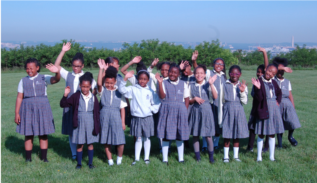
Students who completed the year-round program started the 2016-17 school year with an average GPA of 3.46 and no failing grades.

WSG welcomed its first-ever 3rd grade class for the 2015-16 school year. In addition to meeting students at a critical time in their education, when they transition from 'learning to read' to 'reading to learn,' the 3rd grade served as a pilot for a year-round academic calendar.